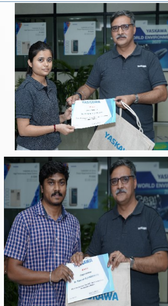
Distribution of Prizes to the Quiz program winners by Bhavani san