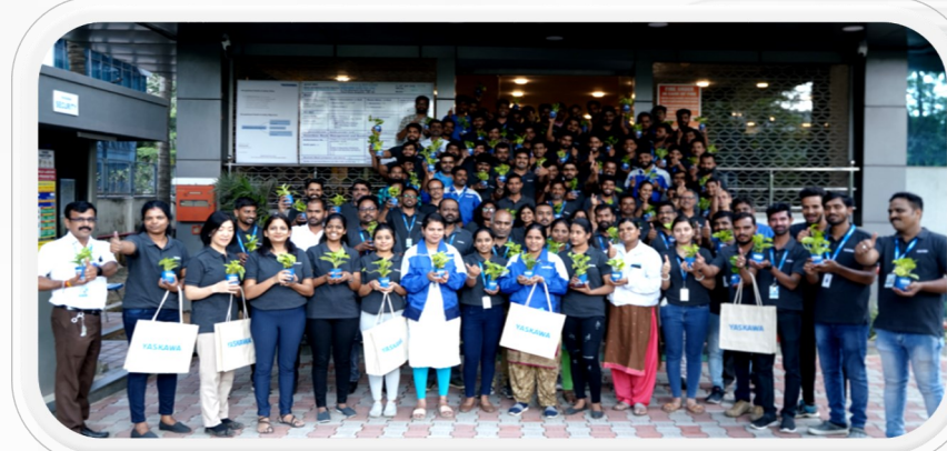
Oath to protect and preserve the environment for future generations.