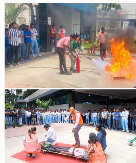
Emergency Evacuation Drill Training to All the Employees

Evacuation procedures were a significant focus, educating participants on swift and organized evacuation strategies. Knowing how to guide individuals safely out of a building during an emergency is paramount, and this training equipped our team members