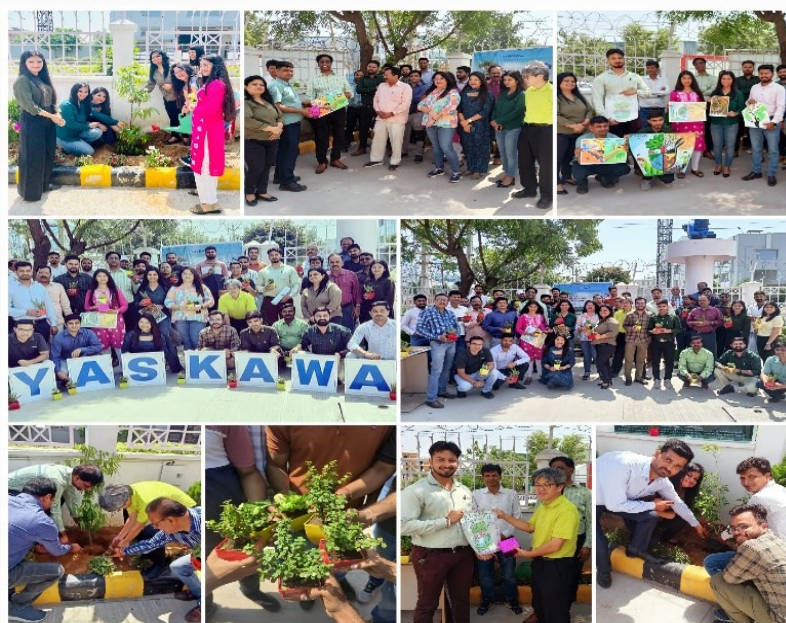
GLIMPSE OF WORLD ENVIRONMENT DAY CELEBRATION On 5th June 2023 at YIND Manesar Facility.

This is a promising first step, but we need all hands-on deck.