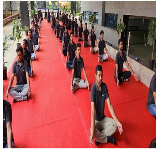
Employees active participation in the International Yoga Day celebration

Cultural Performances: The event featured captivating cultural performances, showcasing the diversity and talent within our organization. Dance, music, and artistic expressions added vibrancy to the celebration.