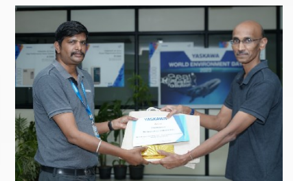
Distribution of Prizes to the Photography event winners by Arunkumar V.B san