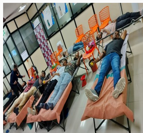
Employee's Participation for Blood Donation Camp

The Blood Donation Camp at YIND bangalore exemplified the company's dedication to giving back to the community. By fostering a sense of social responsibility and actively involving employees and the local population, the event not only saved lives but also raised awareness about the critical need for regular blood donation. Yaskawa India looks forward to organizing more such initiatives, continuing their mission to create a healthier and more compassionate society.